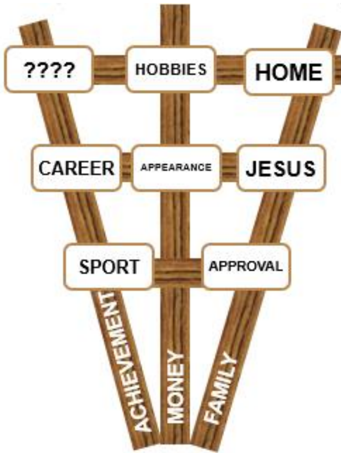
A typical 'Rule of Life' for the world